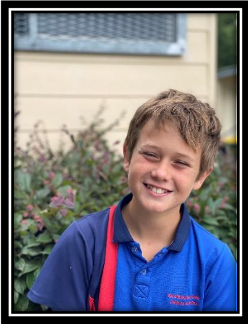
Tiger S 5/6 H

Q. What is one thing you really love doing and why?