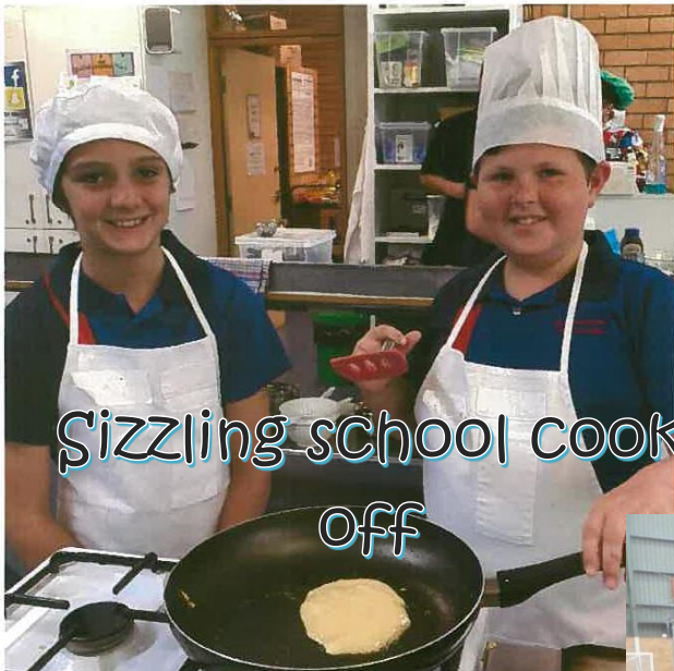
Sizzling school cook off